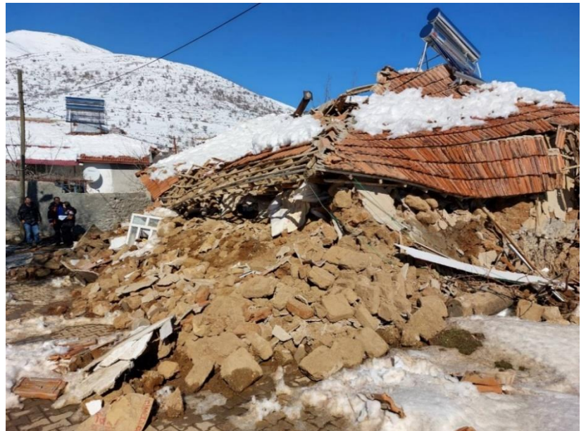
Collapsed building in Malatya, 18 February 2023.

At 4:17 a.m. on 6 February 2023, a 7.8 magnitude earthquake struck close to Gaziantep city in southern Türkiye – the most powerful earthquake recorded in the country since 1939. A second earthquake with a magnitude of 7.6 occurred some nine hours later, with its epicentre only around 70 kilometres from the first earthquake, near Ekinozu city in Kahramanmaraş province. On the same day, the Government of Türkiye issued a Level 4 alarm calling for international assistance, with the earthquakes having caused widespread destruction of houses and infrastructure in urban centres and rural areas across the country. At least 9.1 million people have been directly impacted in the 11 most affected provinces, which include the 10 provinces in which the Government of Türkiye declared a three-month state of emergency on 7 February 2023 (Adiyaman, Gaziantep, Kilis, Hatay, Malatya, Diyarbakir, Adana, Osmaniye, Kahramanmaraş and Sanliurfa) as well as the province of Elazig.