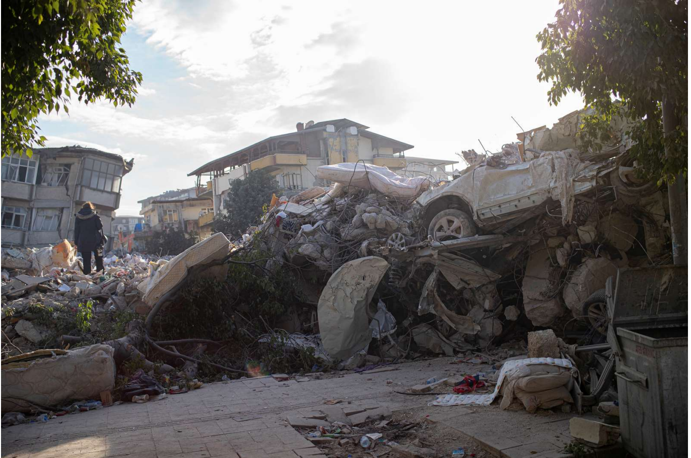
Antakya, Hatay.

Joint multi-sector rapid needs assessments are ongoing in the affected locations. The Central Emergency Response Fund (CERF) approved $10.2m on 16 February to support life-saving multi-sectoral assistance implemented by UNHCR, IOM, UNICEF, UNFPA, WFP, UNDP and NGO partners. Since the February 6 earthquakes, emergency response efforts have been ongoing in support of the humanitarian response led by the Government of Türkiye providing critical supplies, including emergency shelter materials, blankets, hygiene kits, medical supplies, and kitchen items, to earthquake-affected people.