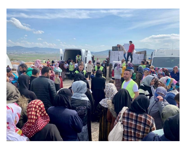
International NGO ACTED provide food packages, baby kits, hygiene kits and kitchen sets to Turkish nationals and Syrian refugees living in informal settlements in Kahramanmaraş.

Temporary Settlement Sector partners identified that the majority of the people living in temporary settlements in the earthquake-affected area, an estimated 1.6 million people, are living in informal settlements, in inadequate conditions and with limited access to essential services. These populations are currently mostly living tents and in makeshift shelters, with high needs and lack of necessary resources. Given the funding constraints and limited operational capacity to provide aid at scale, humanitarian partners are prioritizing reaching out to these most vulnerable populations with much-needed assistance to complement the government-led response.