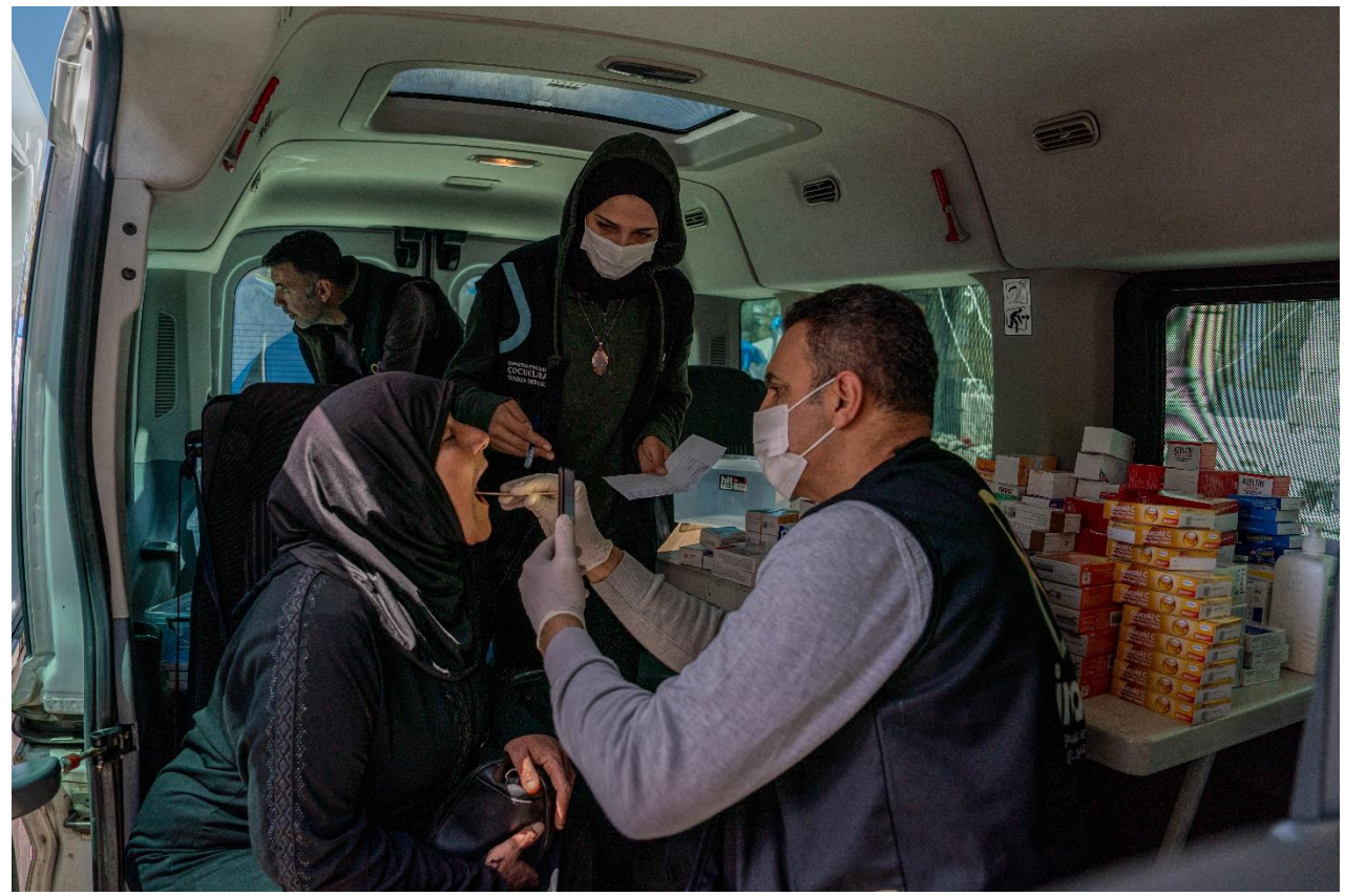
International Network for Aid, Relief and Assistance (INARA) is providing mobile medical services in an informal settlement in Kahramanmaraş to both Turkish nationals and Syrian refugees.