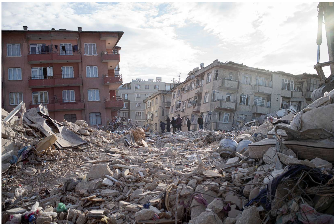
Photo: Antakya, Hatay, Türkiye. 15 February 2023.

As of 16 February, UNHCR has provided 19,500 high thermal blankets, 12,000 foam mattresses and 19,500 kitchen sets, 12,000 supplementary food packs as well as heaters, hygiene items, winter clothes and boots, and other standard core relief items to PMM for distribution in the 12 Temporary Accommodation Shelters (TAC). UNHCR has also provided AFAD with close to 14,300 family tents, some 600 all-weather tents, 10,000 tarpaulin, 6,000 high-thermal blankets, and nearly 12,000 hygiene parcels.