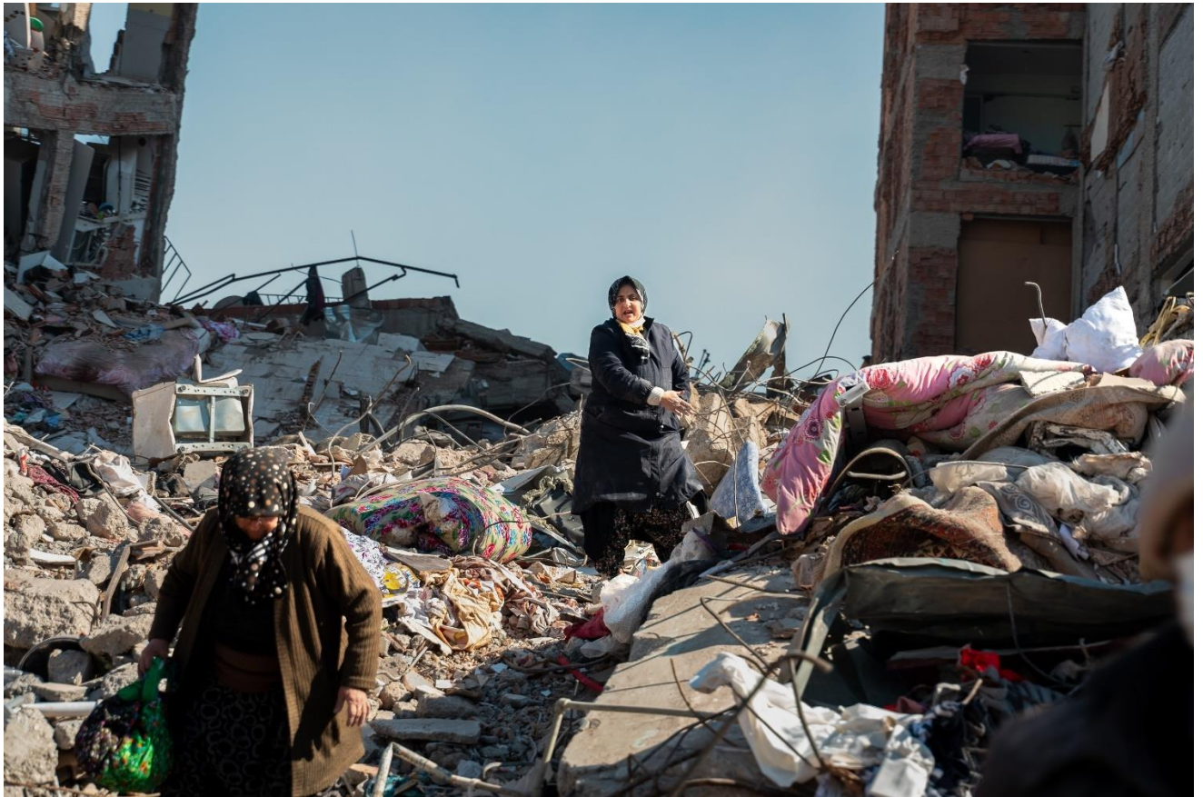
Kahramanmaraş, 11 February 2023. Days after a devastating earthquake, people were looking for their belongings amid the rubble.